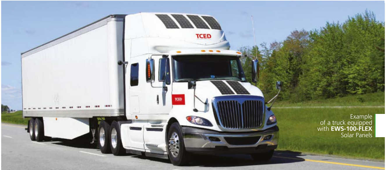
Example of a truck equipped with EWS-100-FLEX Solar Panels